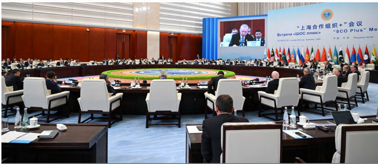
(Mehmet Ali Özcan - Anadolu Agency)

President Erdoğan's characterisation of Türkiye as "the most Western Asian and the most Eastern European" underscored the symbolism of Türkiye being the sole NATO member represented at the Shanghai Cooperation Organization (SCO) summit in Tianjin, held from August 31 to September 1, 2025. This framing reflects not only Türkiye's unique geopolitical identity but also the maturing version of its long-standing balance policy. Rather than belonging exclusively to one bloc, Türkiye increasingly emphasises its role as both a channel and an autonomous actor positioned between East and West.